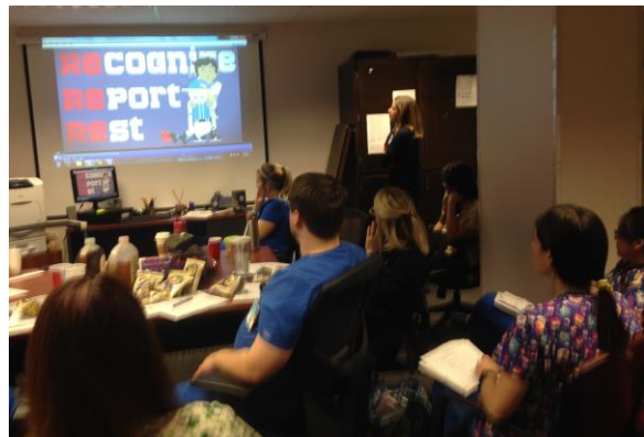
ERLANGER BITL TRAINING HOSPITAL STAFF

A BITL follows up with families after they leave the hospital emergency department if their child has been treated for TBI. When families consent to receive follow up calls, they also potentially receive support from the Department of Education. During FY15, the BITLs served over 1,500 families.