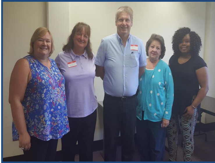
TBI SERVICE COORDINATORS

The TBI service coordinators and the Project BRAIN staff work closely to serve survivors and families. In October 2015, the TBI service coordinators and the Project BRAIN staff attended a training retreat to provide them the opportunity to share resources, participate in team building and to discuss issues of common ground.