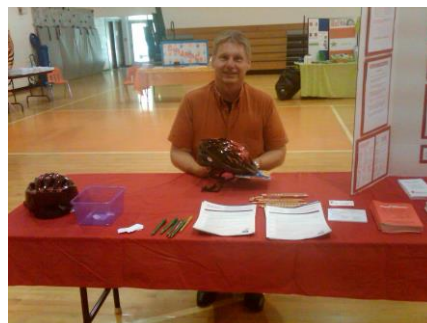
SERVICE COORDINATOR PREVENTION EXHIBIT

The development of the state registry and the resulting availability of statistics are directed toward encouraging research on the causes, effects and treatment of brain trauma injuries. The collection of all types of information on TBI through the clearinghouse will further identify areas for research development. Education and injury prevention activities for health care providers and the public, provide baseline data for pursuing further investigations.