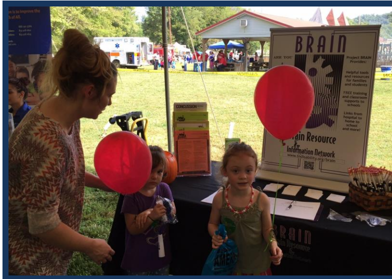
PROJECT BRAIN AT KIDS CENTRAL EVENT