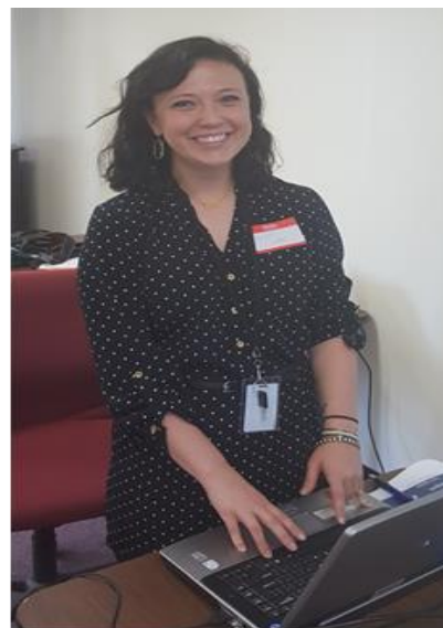
TBI REGISTRY EPIDEMIOLOGIST

Patients seen in emergency rooms who were sent home the same day are not required to be reported to the registry. All hospitals in the state are currently in compliance with this legislation although some do not report on time. The data enables staff to pinpoint the population being affected by brain injury and are used for injury prevention and health care planning. [See also TCA 68-55-202(a) (5)]