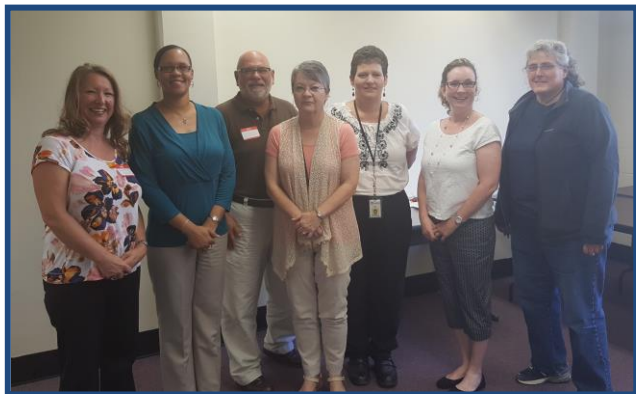
TBI ADVISORY COUNCIL MEMBERS

The duties of the Advisory Council are to advise the TBI coordinator, make recommendations and perform other duties as necessary for the implementation of a state-wide plan to assist TBI persons and their families. The Advisory Council is composed of individuals dedicated to improving the lives of TBI survivors in Tennessee. Their advice and recommendations have been invaluable to the development of the TBI program. The TBI Advisory Council is currently investigating options to utilize available resources in the TBI trust fund for the benefit of TBI survivors.