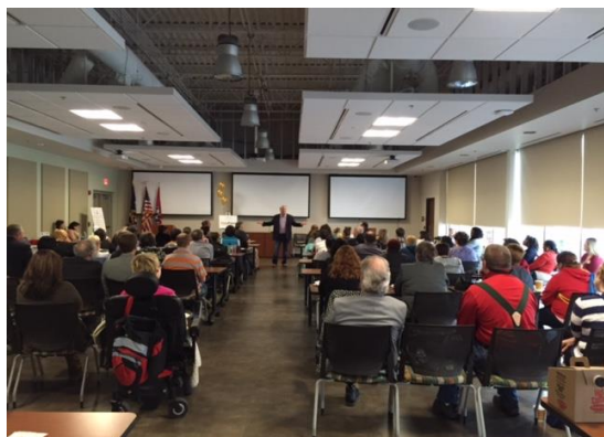
FAMILY DAY CONFERENCE 2016

attend formal or informal education programs through colleges, workshops, seminars, or conferences;